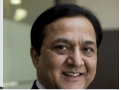
Rana Kapoor Founder & CEO, Yes Bank