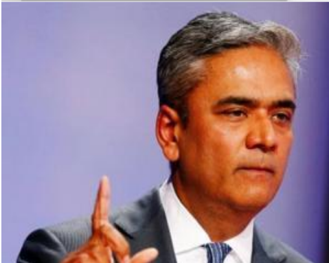
Anshu Jain Former Co-CEO, Deutsche Bank