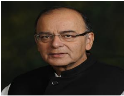
Arun Jaitley Union Minister of Finance