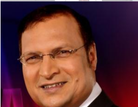
Rajat Sharma Chairman, Chief editor, India TV