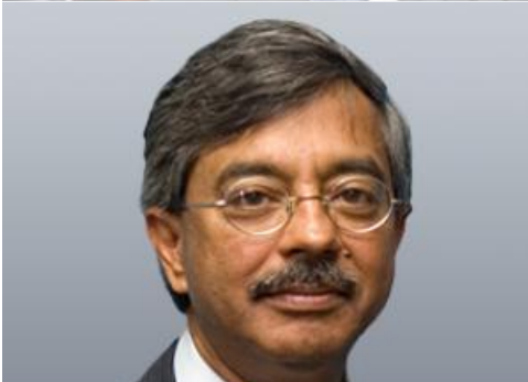
Pramod Bhasin Former CEO, Genpact