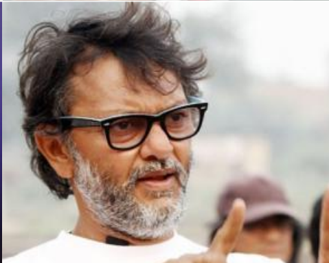
Rakesh O. Mehra Renowned Film Director